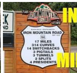
Iron Mountain Road