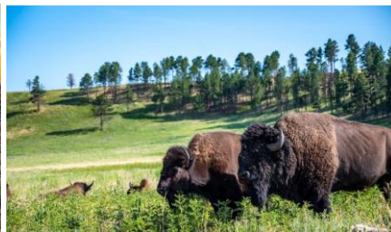
Custer State Park