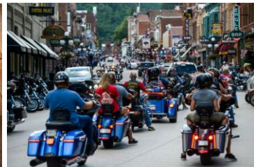
Sturgis Motorcycle Rally